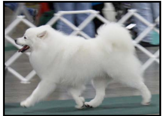
Sire: AKC CH / UKC NBOB NGRCH URO1 GRCH NRDC WHSPRS A W D CHALLENGER (Charlie)