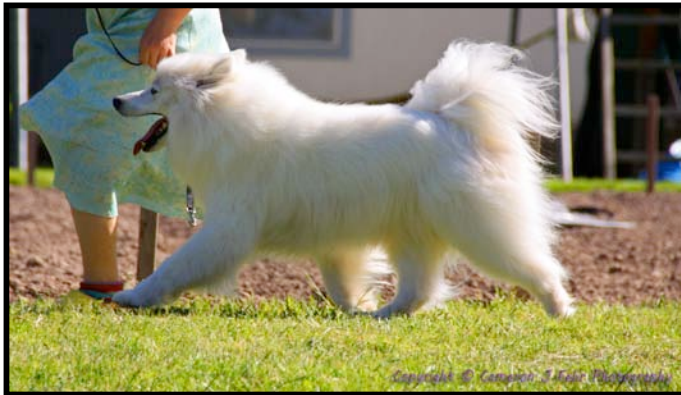
Dam: UKC CH A W D ST. HELEN'S FIRE (Flame)

1 female and 3 males Born October 29, 2011