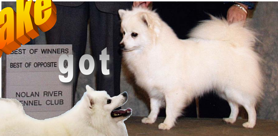
MAJOR AKC POINTED/GRCH 'PR' Excel Kort-Mar Geisha Special